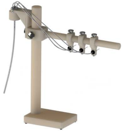
** MULTIPLE NEEDLE HOLDERS WITH MANIFOLD