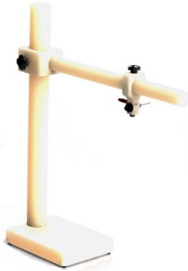
* SINGLE NEEDLE HOLDER