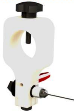
*** NEEDLE HOLDER

The system can be extended with other needle holder, up to 3, and for this purpose the system can be integrated with a manifold to optimize the polymer solution flow.